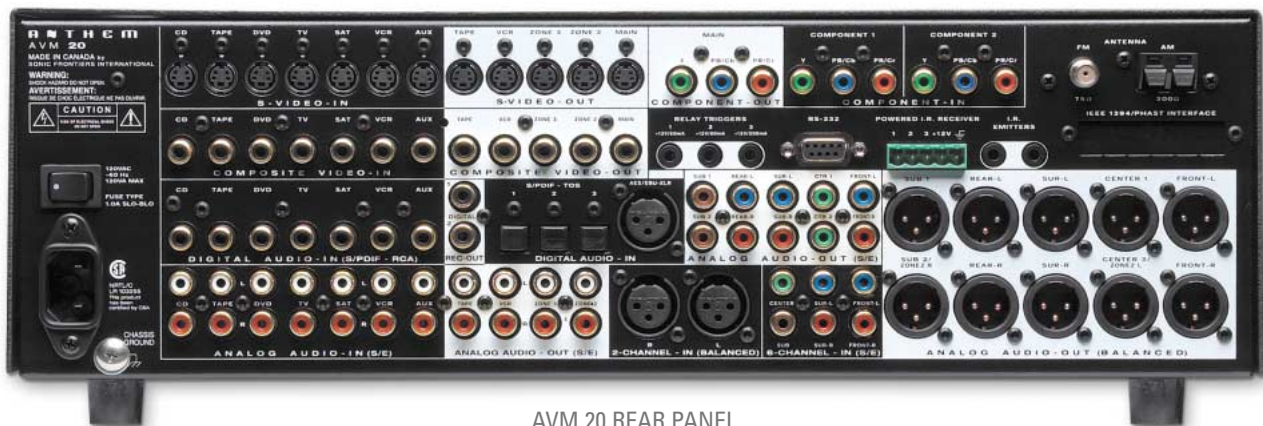
AVM 20 REAR PANEL