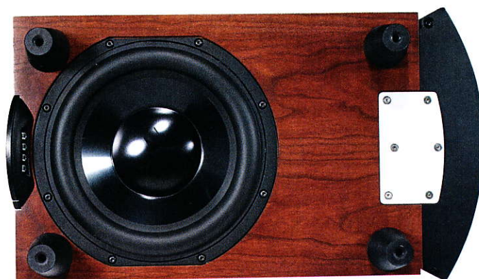
Firing downward is a 10in aluminium cone bass unit, as well as white LEDs for floor illumination. This unit progressively moves out-of-phase with the forward bass unit at higher frequencies to improve matching to the dipole XStat panel.

Running the two bass units progressively out-of-phase to mimic dipole dispersion at crossover reduced energy in the crossover region and this can be seen as a shallow dip in upper bass in our